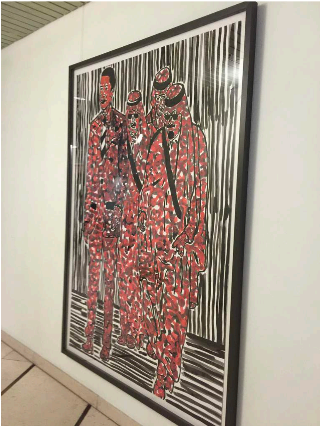
Artwork in the former ING head office, Amsterdam Zuidoost